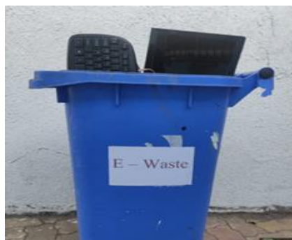
Segregation of E – Waste observed at SGDC.