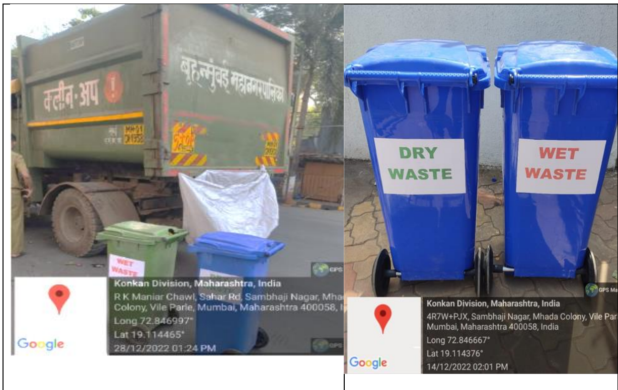
Segregation of Waste at the source of generation by using different coloured dustbin observed inside the Campus.

Bio wastes are originated from plants animals and food wastes which also affect the environment to a greater extent. Depending on the biowastes quality, it can be recycled or reused for energy production. Plant wastes can be reused as a building material, recycled into mulch for landscaping, pulp for paper production, and used as a fuel. The rising cost of waste material disposal and a growing environmental consciousness also contribute to the increasing importance of waste wood recycling. The reason for recycling waste wood is world approaching closer to global warming and reduce their global footprints. S.A Engineering Campus (Autonomous) is at the initial to collect the various biowastes across the campus and recycle them properly without harming the environment. Recycles biowastes are reused for plant cultivation as manuring.