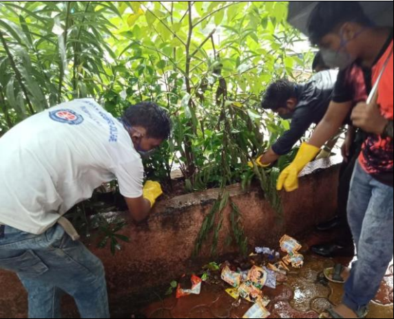
College Campus Cleaning organized by NSS dated 10 th Oct 2019