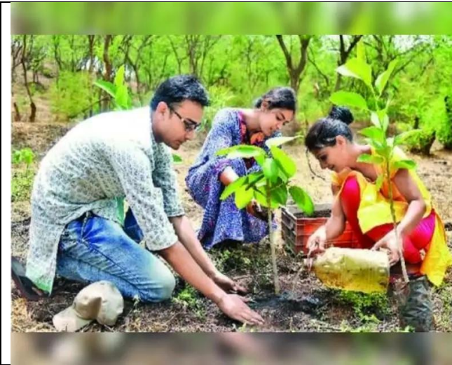
World Environment Day Organized by NSS dated 06/06/2018