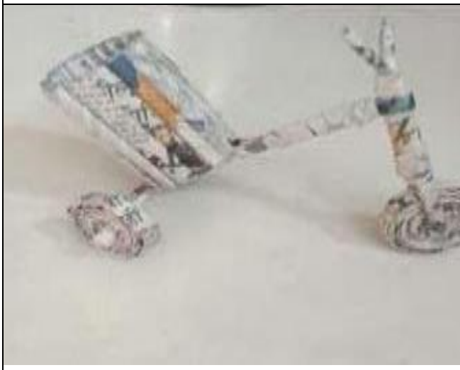
Online Awareness towards Eco- Friendly Products and Its Impact an Environment 16/10/2021