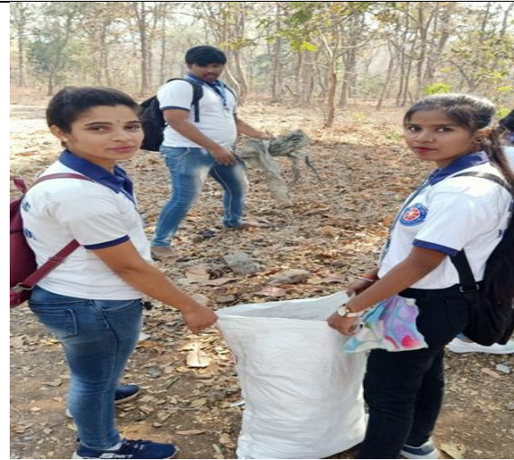
Paper Bag Making and Distribution Drive Organized by Nature Club dated 30/09/2022