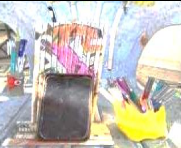
International cleaning day awareness organised by NSS 17/09/2022