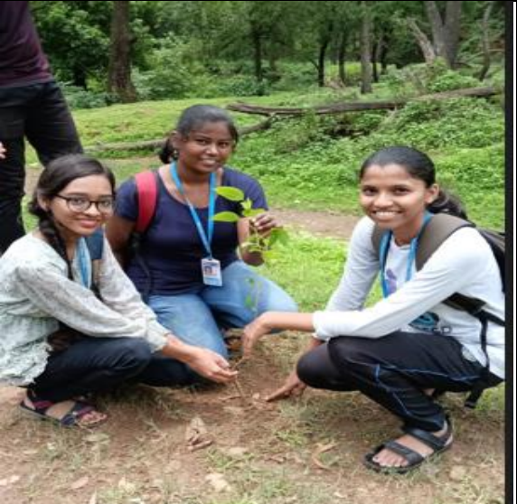
World Environment Day Organized by NSS dated 06/06/2019