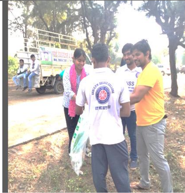
Collection of plastic waste to recycle organised by NSS 21/02/2022