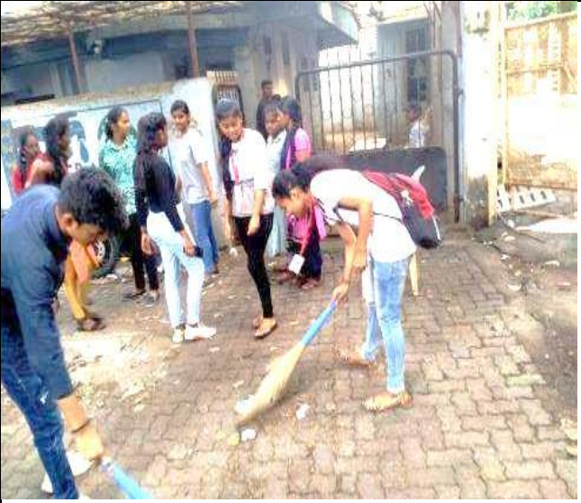
College Campus Cleaning Activity Organized by NSS dated 10 th Oct 2018