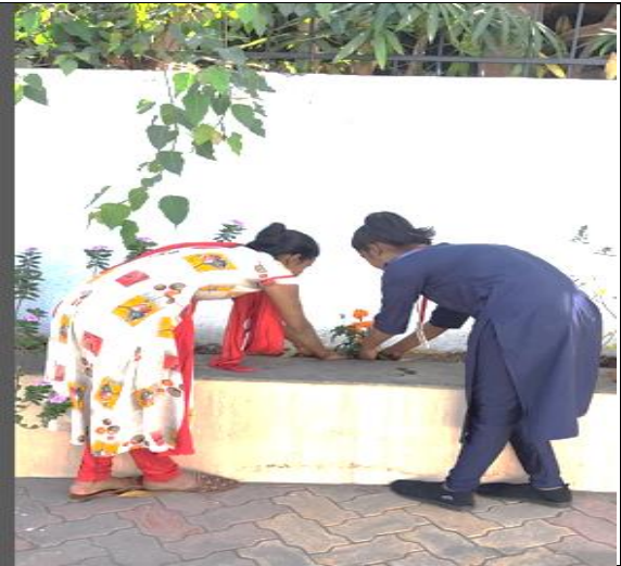
Tree plantation at college campus organized by NSS 13/6/2018