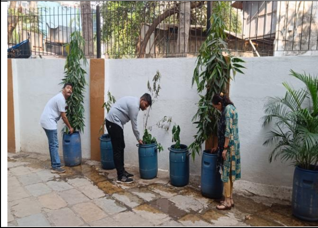
Tree plantation at college campus organized by NSS dated 13/6/2018